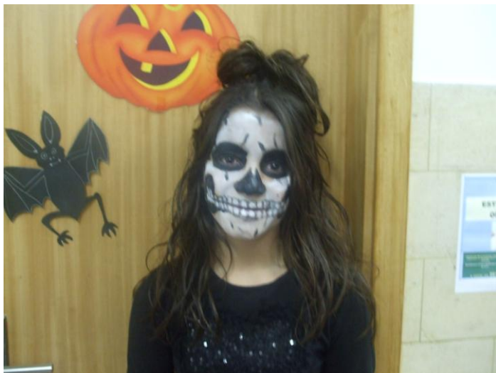
These masks were made by the students

Here are some photos of the Halloween party we had at the Institute. We hope you had fun! Some of your costumes were FANTASTIC, so thanks.